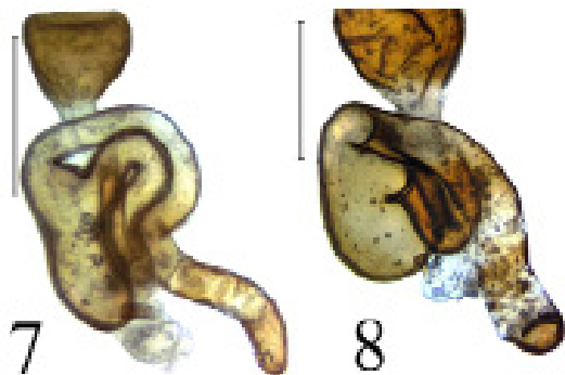
Fig. 7–8. — Spermatheca of Stenus (Nestus) spp. 7. S. (N.) pluvius sp.n. (PT). 8. S. (N.) ageus Casey, 1884 (Khabarovsk Territory). Scale = 0.1 mm.

New material examined. USA: 1 female (OSU): Camden, N.J. 23.II.; H.W.Wenzel Collector; H.W.Wenzel Collection.—1 female (OSU): Huachu. Mts, Ariz. VII.26.; Miller Can. HA.Wenzel [leg.]; H.W.Wenzel Collection.—1 female (AR): Alaska 76–76, Cirkl Hot Springs. 24.08.1976. E.Matis leg.—5 males, 1 female (UAM): ALASKA: Sheenjek River, wet meadow. 1–30.06.2000. A.Johnson leg.—1 male, 1 female (UAM): ALASKA: Sheenjek River, open spruce. 1–30.06.2000. A.Johnson leg.—2 females (UAM): ALASKA: [Arctic Nat. Wild. Ref. (ANWR)] Sheenjek R, wet meadow. Trans 5, trap 5. 18.06.2000. A.Johnson leg.— RUSSIA: SVERDLOVSK AREA: 1 female (ZIN): Perm Government, near Ekaterinburg, Uktus. 09.06.1910. G.G.Jakobson leg. [‘ argus Gr. L.Benick det.’]— YAMALO-NENETS AUTONOMOUS REGION: 1 male (AR): South of the Yamal Peninsula, Priuralskiy District, Tarcheda-Yakha River near mouth. 23.07.1980. E.M.Veselova leg.—1 female (AR): South of the Yamal Peninsula, Priuralskiy District, near Shchuchye trading station. He4a: Calamagrostis lapponica . 29.07.1980. E.M.Veselova leg.—1