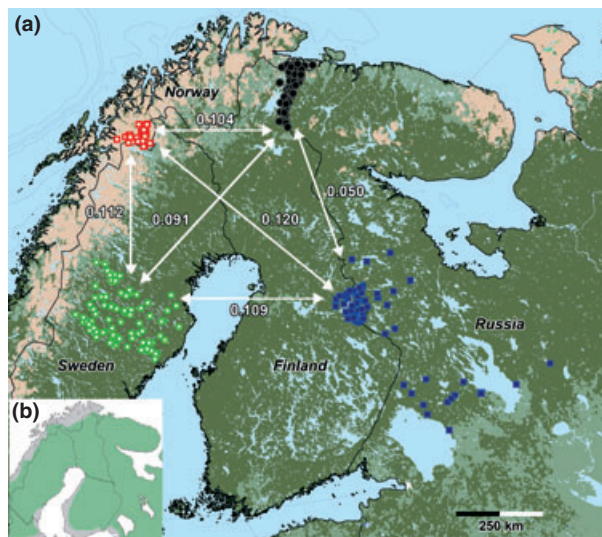
Fig. 1 (a) The four sampling locations in Northern Europe and pairwise F_{ST} values among them. Each mark represents the average position of a genotyped brown bear. Black filled circles: Pasvik ( n = 94 ), red open squares: Troms ( n = 34 ), green open circles: Västerbotten ( n = 84 ) and blue filled squares: Karelia ( n = 79 ). The map legend is as follows: blue = water bodies; dark green = forest cover; light green = brush/scrub/grassland; light brown = tundra. All F_{ST} values are significant, the arrows indicate the pairs of populations compared. (b) Map showing brown bear distribution across Northern Europe. Green = area with possible brown bear occurrence (see also http://www.lcie.org ), dashed line = southern border of the reindeer husbandry area in the three Nordic countries.

A detailed description of PCR protocols and the fragment analysis as well as protocols for individual